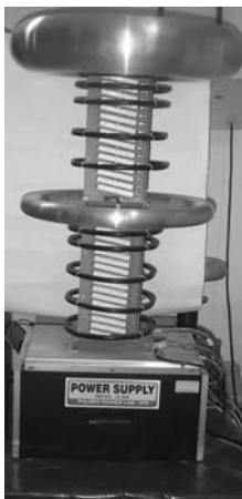
Fig. 3 High Voltage power supply

Apart from ion source and extraction power supply on high voltage deck another high voltage power supply is used to accelerate deuterium ions. This high voltage power supply (Fig. 3) is Glassman make 300 kV dc with a maximum current of 10 mA. It is characterized by high reliability, high terminal voltage stability, low terminal voltage ripple and low voltage regulation. Operating voltage will be 200-250 kV. The high voltage power supply is connected with RS 232 port to computer for online voltage setting.