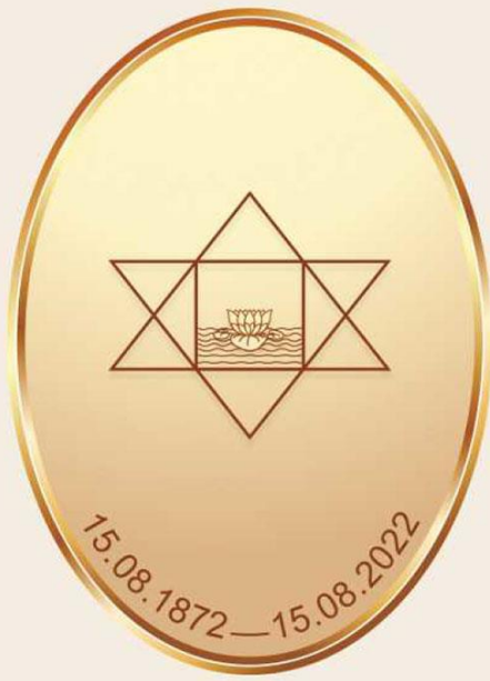
The 150 th Anniversary of Sri Aurobindo's Birth