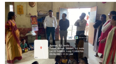
Anganwadi Visit in the presence of Vice Chancellor (offg.) ,SPU