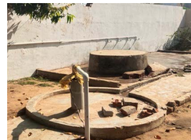
Constructed a tank to facilitate drinking water facility at Primary School, Ravipura; aided by Sardar Patel University