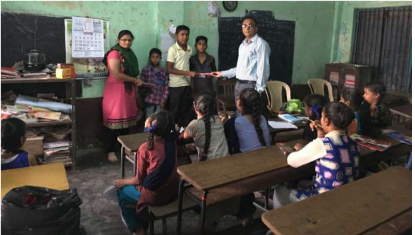
179. Gam Shabha-“ Grahak Shuraksha” at Ardi Village, Petlad