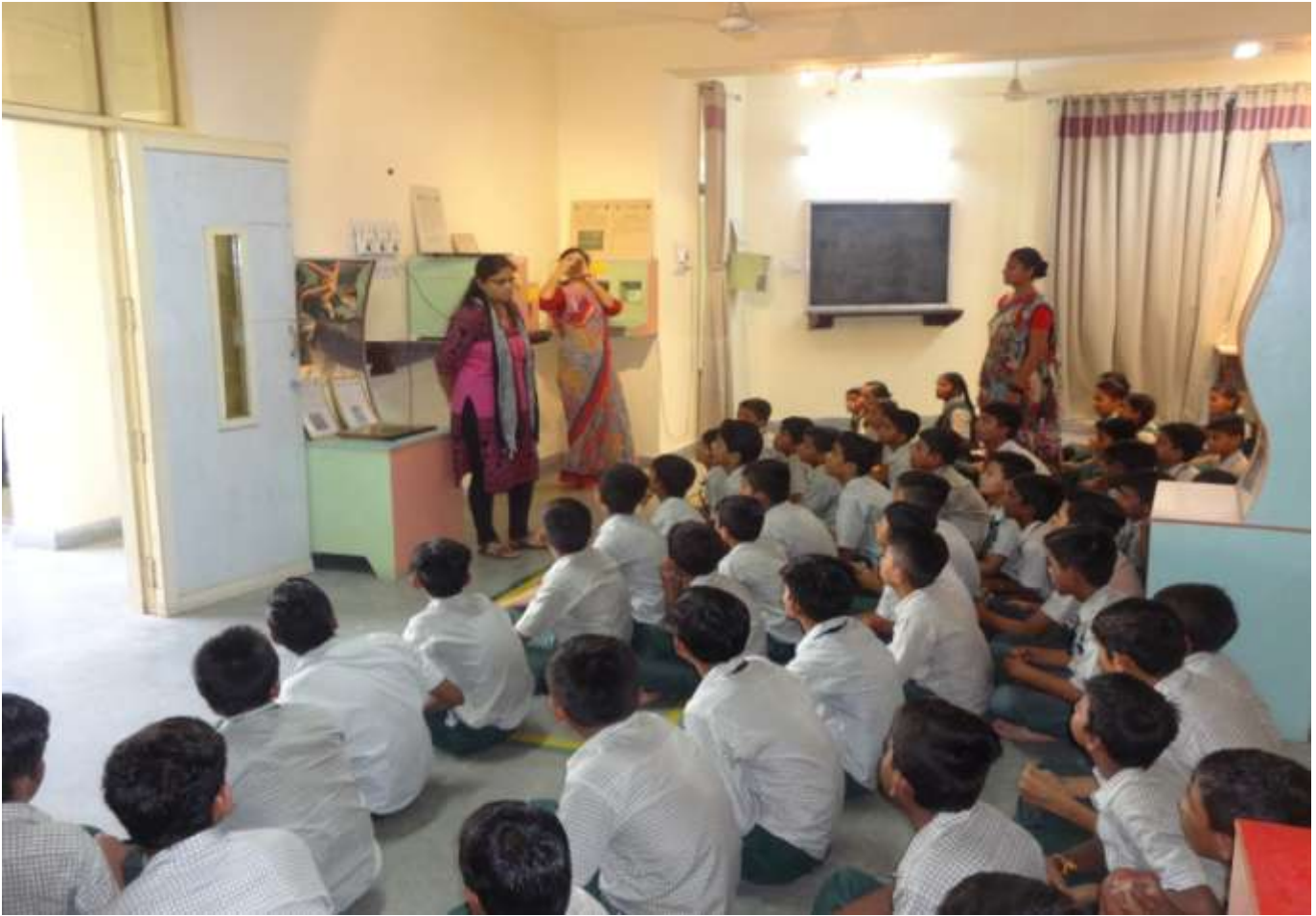
33. and 34. - Visit of CSC by Nagar Primary School No-30